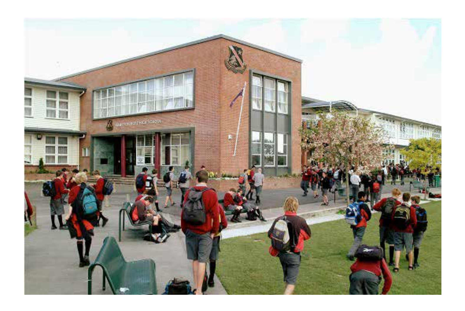
Brochure Design & Printing kindly donated by Fusion Print Group Ltd