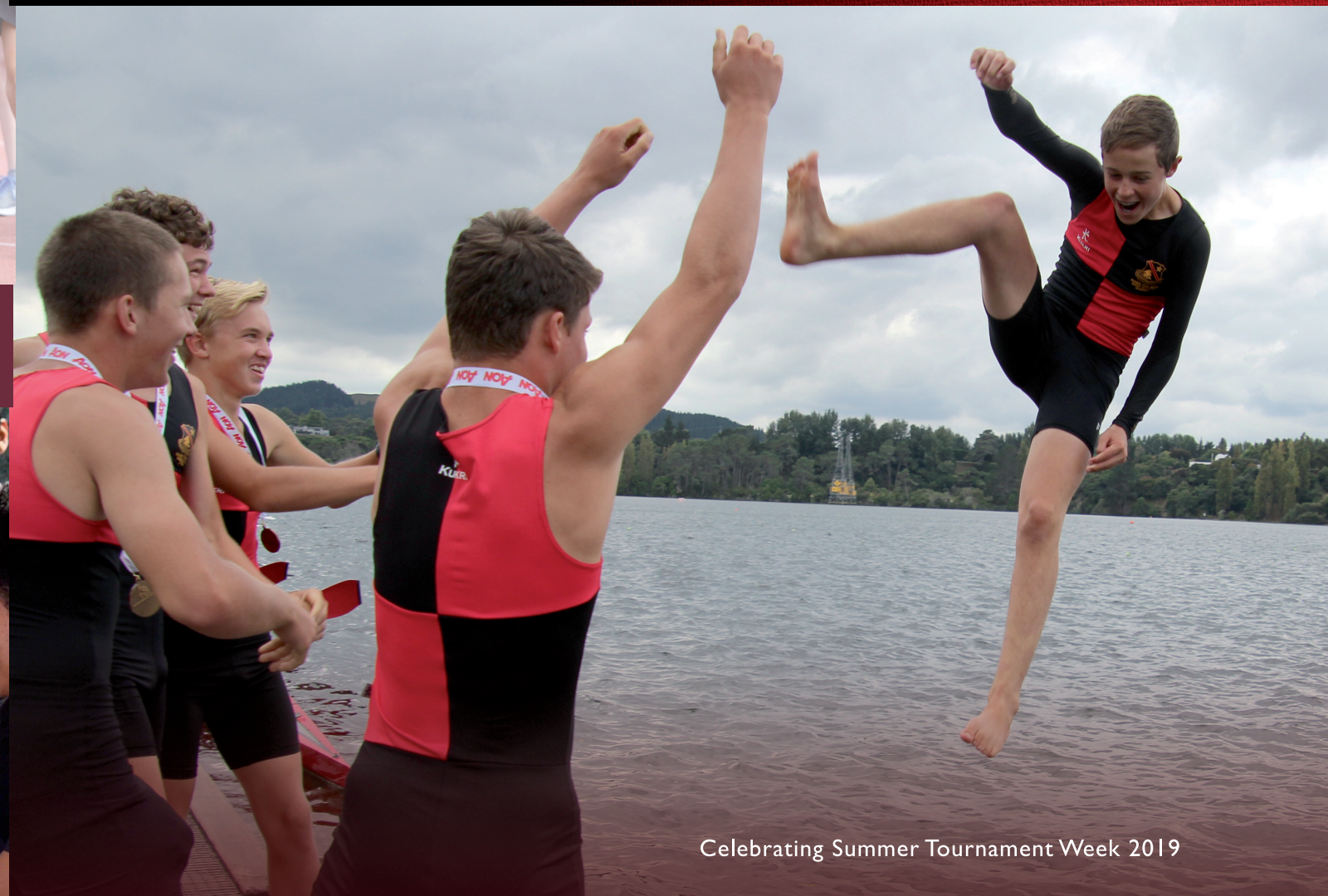
Celebrating Summer Tournament Week 2019