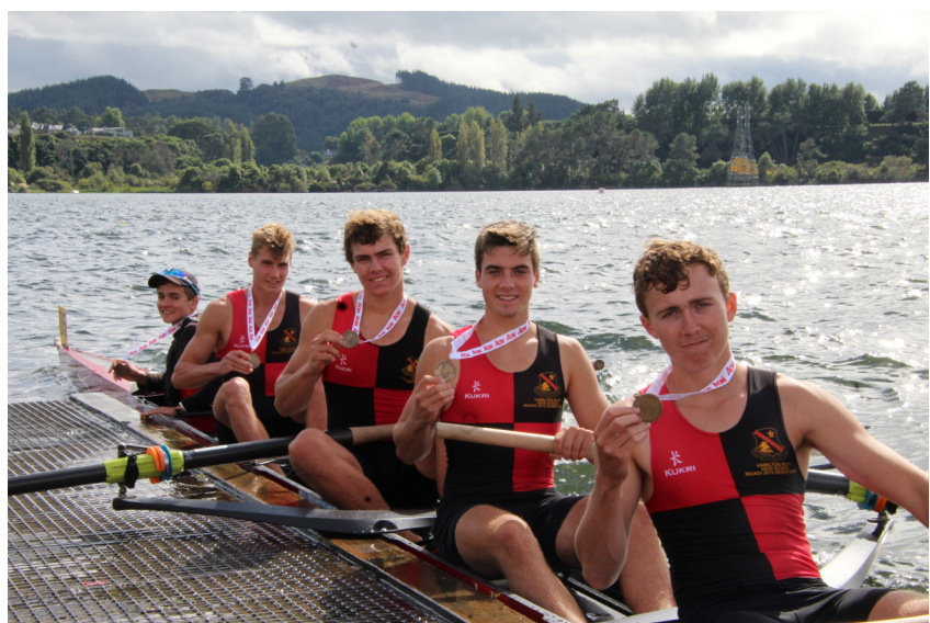
Top: The Under 15 Eight and Octuple with their gold and silverware. Bottom: The victorious Under 17 Coxed Four proudly display their gold medals.