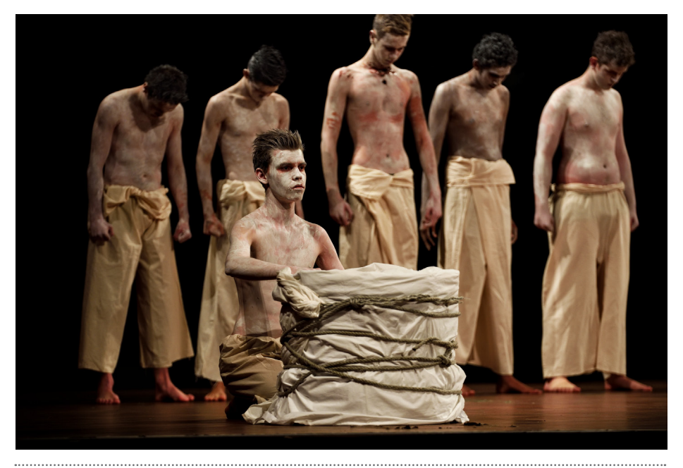
Top: The stunning opening tableau that goes on to depict the triumph of the Roman Army over the Goths, and Titus's fateful decision to sacrifice the eldest son of Tamora as a tribute to his victory. Below: the Chorus avert their eyes from the terrible consequences of Titus's actions and the horrific revenge taken by Tamora and her sons.