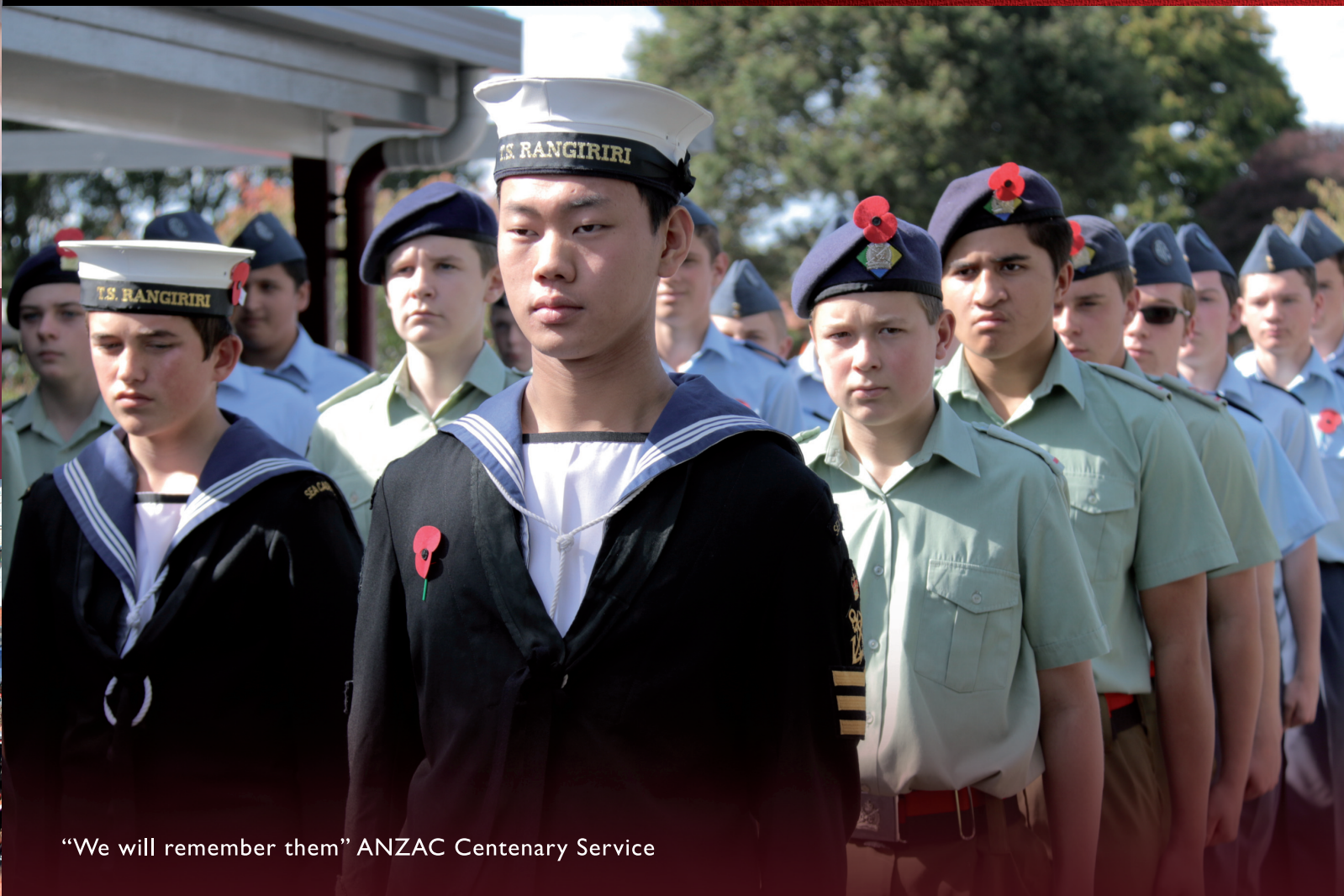
"We will remember them" ANZAC Centenary Service